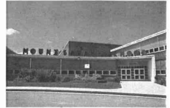
Mt. Savage Elementary School