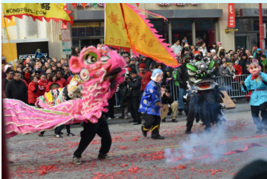
Chinese New Year Parade, Washington, DC