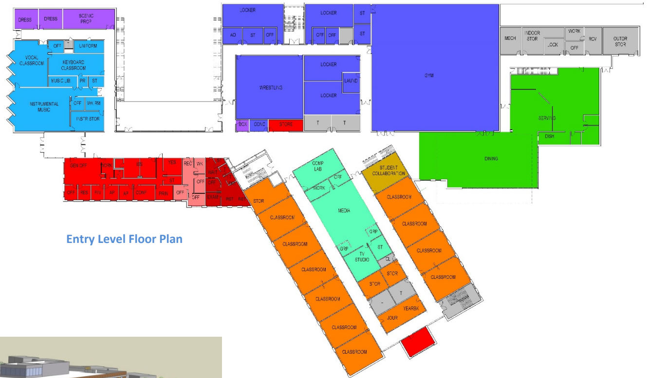
Entry Level Floor Plan