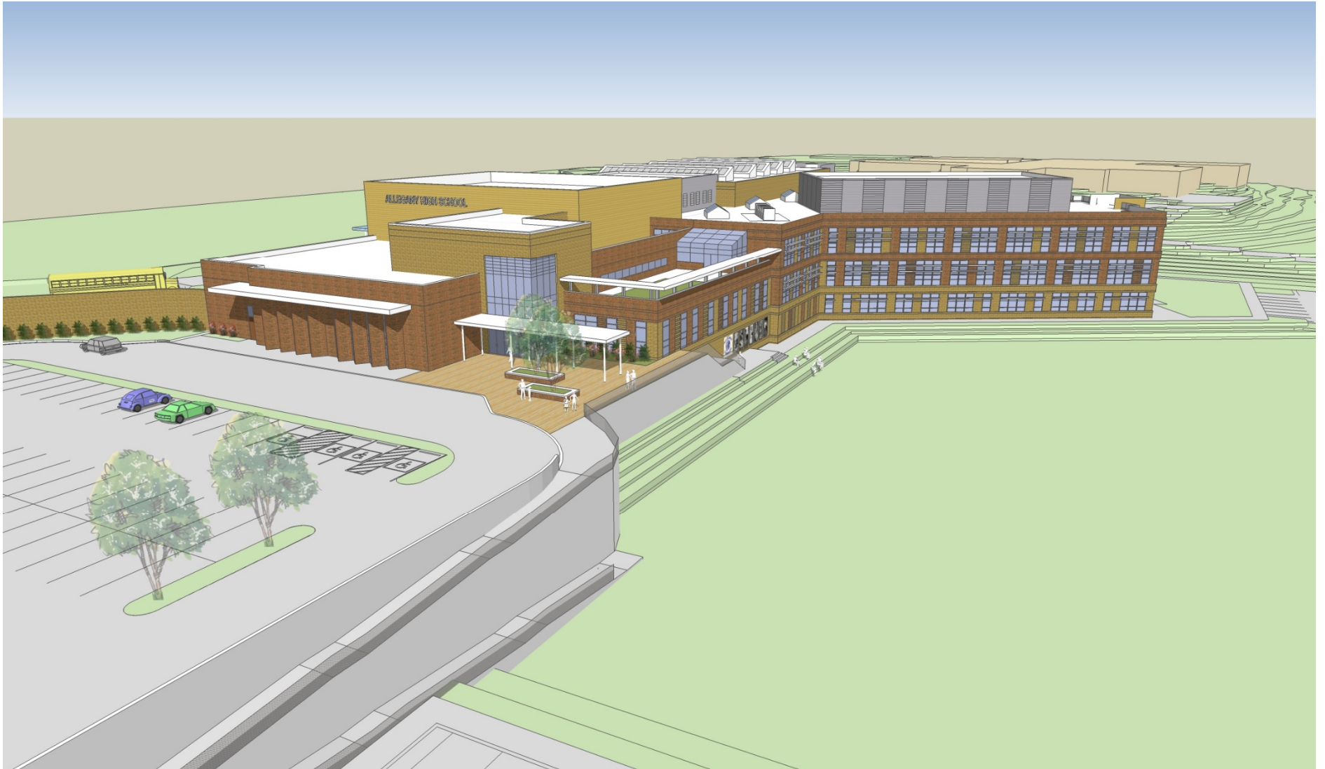
Aerial View From The South